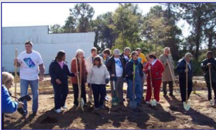
Representatives from each Apostle church break ground on their work-site.

Construction began on Saturday, January 29 th and we have been moving along quickly ever since. Our apostle Churches are listed below and thanks to their steady and consistent volunteer efforts we have pushed ahead of schedule by two weeks. Everyone is working really hard and having a great time on the worksite. Our homeowner has been truly blessed by all the help she has received to build her home. All of our apostle's have been a true blessing to our ministry and we are anxiously looking forward to our Saturday, June 3 rd dedication worship service.