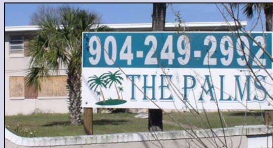
The Palms Apartments, 100 units condemned by the City of Atlantic Beach, FL.

With a housing boom, fueled by low interest mortgages, it is not surprising that many owners find it more profitable to sell their properties than continue renting to their existing tenants, especially in the Beaches real estate market. In a free enterprise economy, these owners are under no obligation to continue their existing rental programs. In addition, as housing costs outpace income growth, the problem will become more serious for both low and middle-income homeowners. The issue is not only land costs but also construction costs, which have risen over 1/3 for our new Habitat houses in the last two years alone. 10 years ago, when I began a second career at Habitat, we were selling homes for $35,000. Today, we sell them for $82,000.