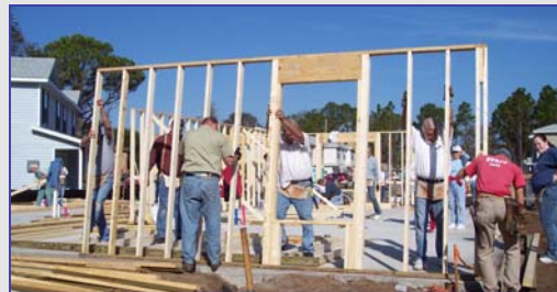
Apostle's work together to raise a wall on the first day of construction.