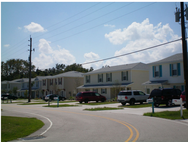
Where we've been in the community.... The Shangri La Development