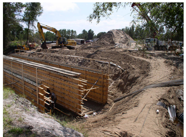
And where we're going... Haywood Estates starts mid-October!